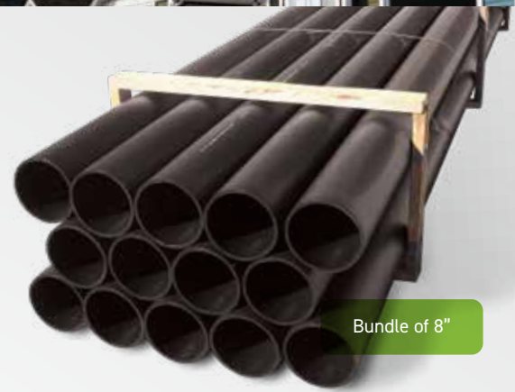
Bundle of 8"