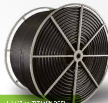
1 1/4" on TITAN™ REEL