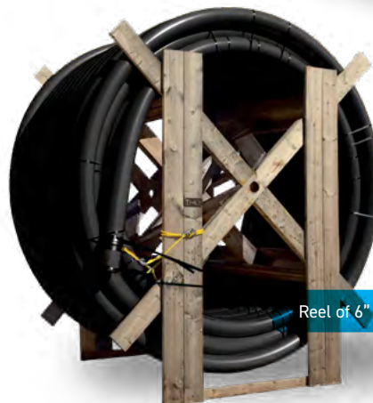
Reel of 6"