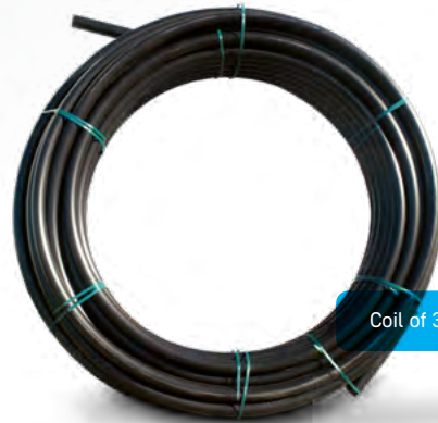
Coil of 3"