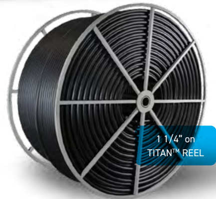
1 1/4" on TITAN™ REEL