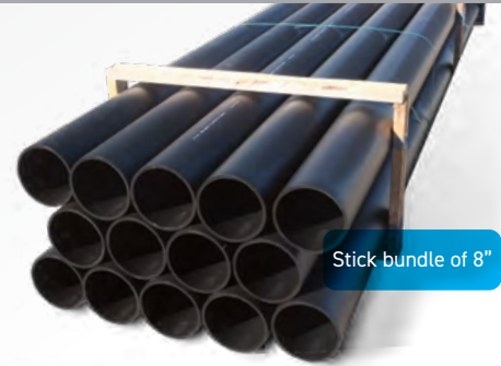
Stick bundle of 8"