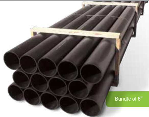
Bundle of 8"