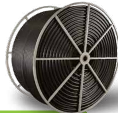
1 1/4" on TITAN™ REEL