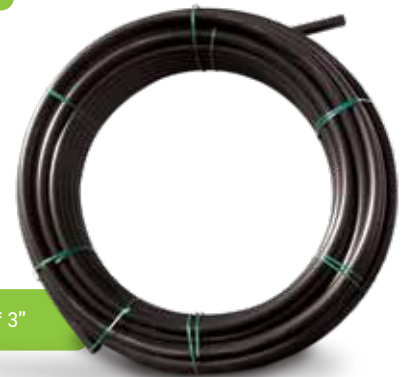
Coil of 3"