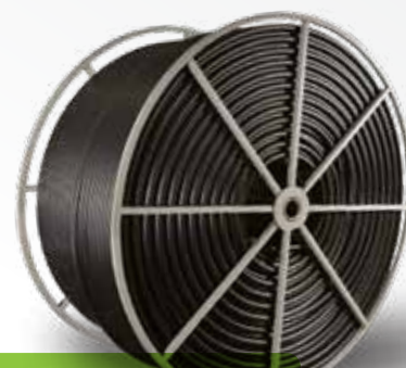
1 1/4" on TITAN™ REEL