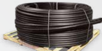
LOOP ON PALLET

Using the new VERSAPOINT fitting, the TWINLOOP geothermal loop consists of 4 parallel pipes that form 2 independent closed loops. With twice as much exchange surface compare to single loop, the TWINLOOP helps extract more energy from each borehole, leading to significant drilling depth reduction and associated cost savings.